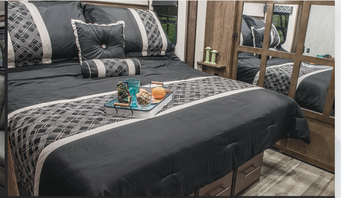
POWERS YOUR KING SIZE ELECTRIC TILT BED (SELECT MODELS)