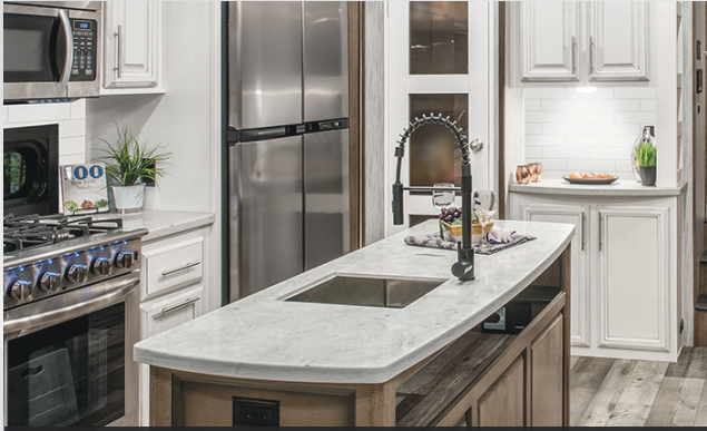
POWERS YOUR REFRIGERATOR + FREEZER + DISHWASHER