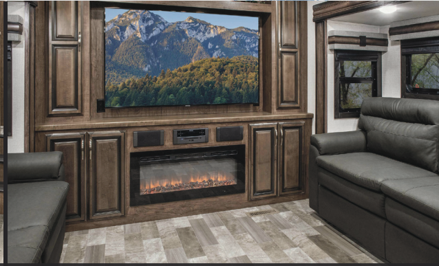
POWERS YOUR TV + DVD PLAYER + BLUETOOTH SPEAKER