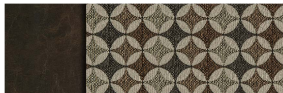
French Roast Décor