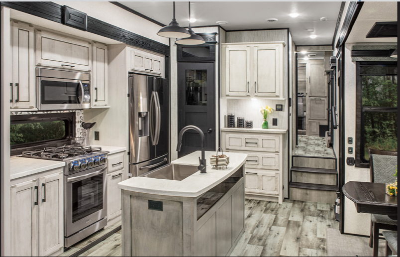
POWERS YOUR REFRIGERATOR + DISHWASHER