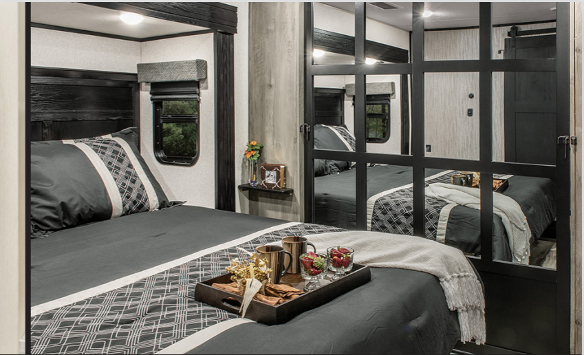
POWERS YOUR ELECTRIC TILT BED

Whether its a short weekend gateway or a week long dry camping trip, our "Off the Grid" packages powered by Xantrex ensure you always have the power needed to stay comfortable, just like you were at home. The Xantrex system can power a range of electronics and appliances. It will keep batteries charged from the sun and shorepower when available, ensuring you always have power for essential electronics and appliances. This all happens quietly and efficiently behind the scenes allowing you to experience what you value the most – fun, freedom, and adventure.