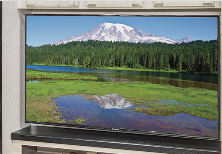
POWERS YOUR ENTERTAINMENT ELECTRONICS