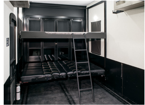
The roomy garage is versatile, functioning as a garage, bedroom, and dining area. The optional 60" x 84" power bed with sit and sleep rises and falls with ease, allowing you to customize the space to your needs.