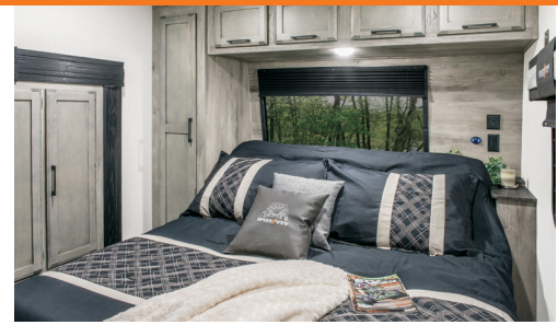
Recharge for tomorrow in the electric tilt bed with a Serta Comfort King Foam Mattress. Storage options abound, and washer/dryer prep is tucked into the closet.