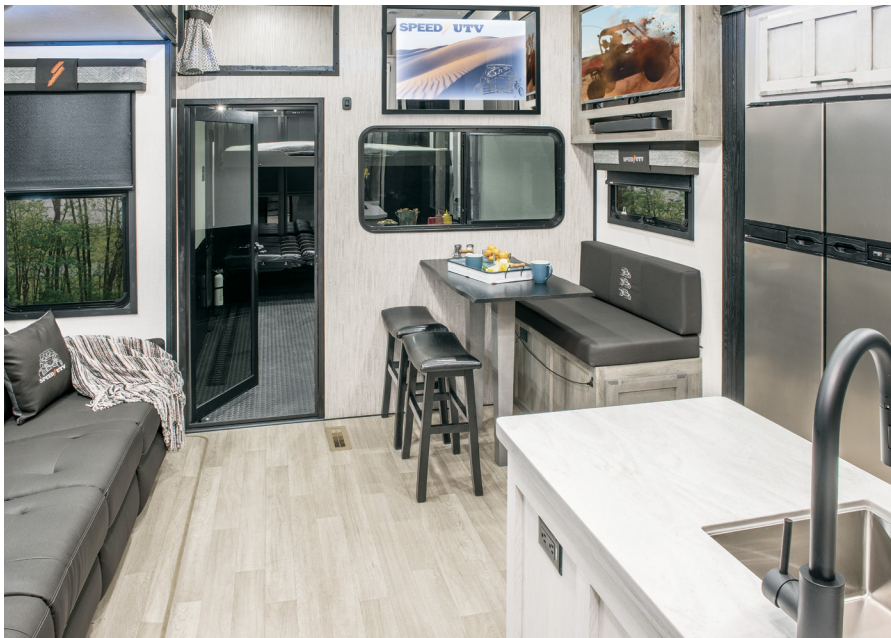
Bring the party inside! The comfy super sofa includes USB charge ports and is in perfect view of the entertainment center. Robby Gordon accents add flair to the experience.