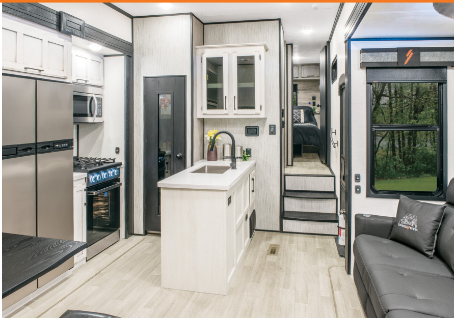
Fuel your body for the next adventure with the residential kitchen, featuring stainless steel appliances and tons of storage options.