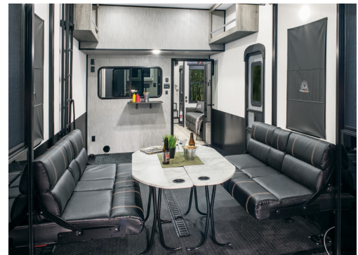
Take a much-needed break and transform the garage into a dining area. Overhead storage compartments allow you to keep your gear organized and out of the way. Elevate the experience even more with options like ramp door patio rails and the three-season patio door.