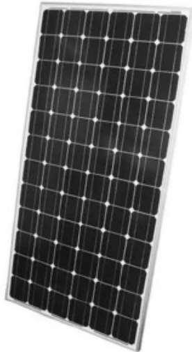
8- 220 Watt Solar Panels