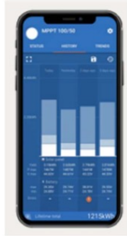
Phone App ( Victron Connect )