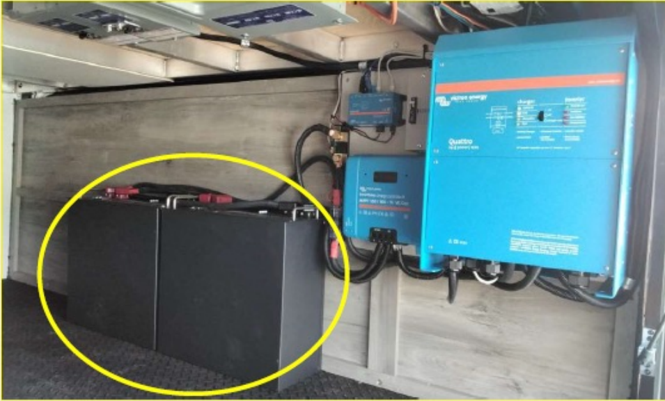
Battery (front view)