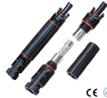
Fuse's On Roof To Protect The Panels & The Wiring