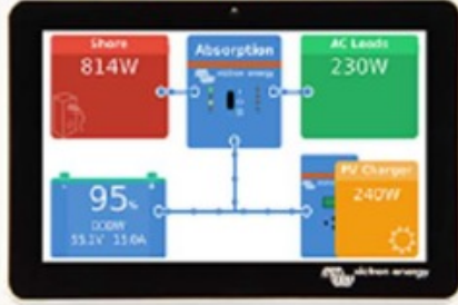
Digital Display Inside Of Unit