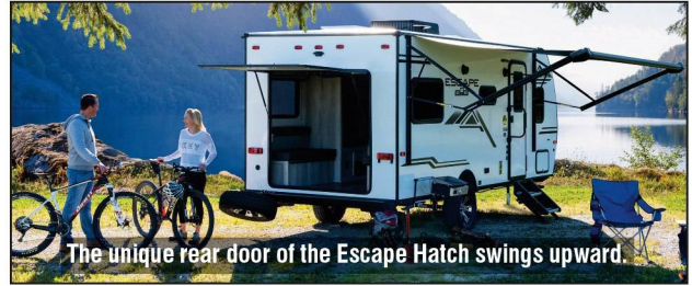
The unique rear door of the Escape Hatch swings upward.

The Hatch Series comes standard with off-road tires and an enclosed, heated underbelly