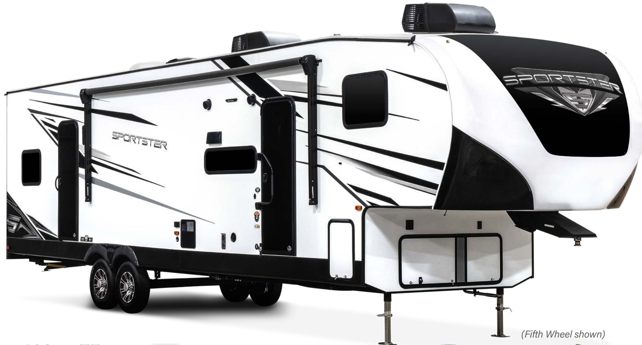
(Fifth Wheel shown)

TRAVEL TRAILERS & FIFTH WHEEL TOY HAULERS